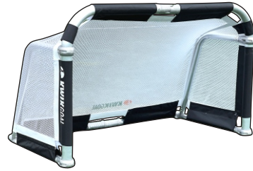
Goalazo Goal (1)